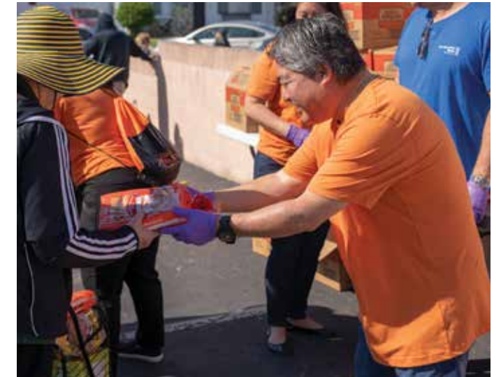
In April, City National Bank and King's Hawaiian joined together by supporting and volunteering at our Mobile Food Pantry distribution at the Crenshaw Baptist Church of Torrance.